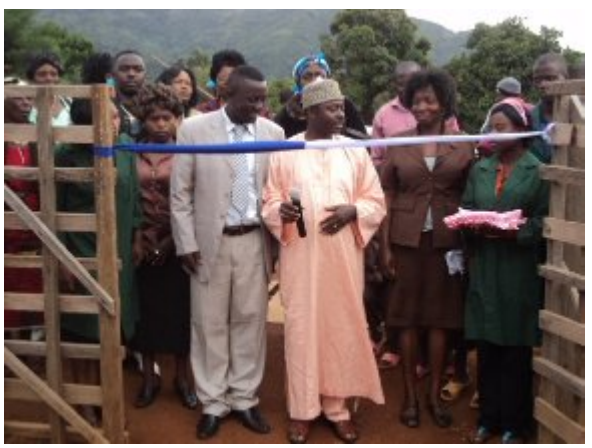
Oku Divisional Officer inaugurate VTC

National Day was celebrated by CAMGEW team on the 20th May 2013. CAMGEW-VTC took part in the Cameroon National Day celebration through match pass and demonstration. Her intention was to show her patriotism to her fatherland and use the match pass to advertise the services and products of the VTC to the public. To participate, CAMGEW prepared some sign posts with the names of various CAMGEW-VTC training workshops and other activities carried out by CAMGEW. The students and teachers matched in their uniforms. CAMGEW-VTC's match pass was demonstrative. The trainers and students matched with items that they produced on their hands. There were shoes, uniforms for elementary schools and the hair dressing department carried along to prepared hair products and tools. Our match pass attracted much attention and we were proud.