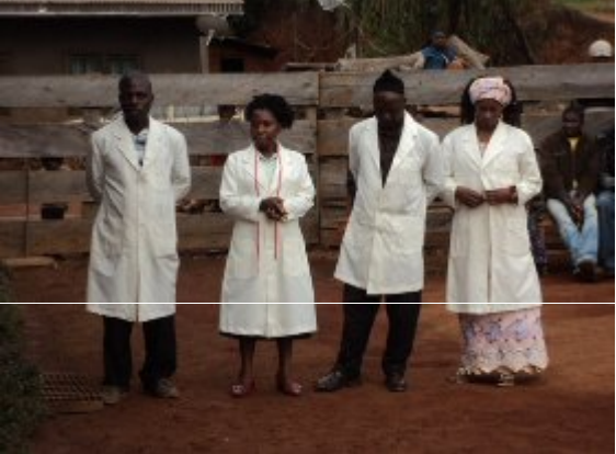
VTC students' presentation