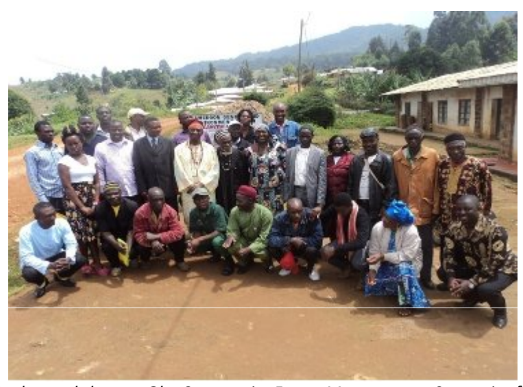
Participants in the workshop on Oku Community Forest Management Strategies for Livelihoods