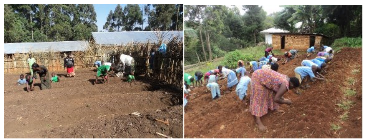
Children learn-by-doing in school farms