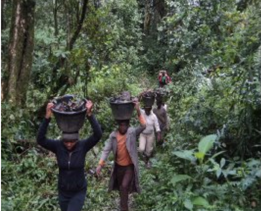
Men ready for clearing