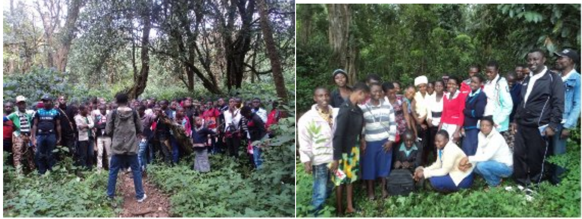
Environmental education in the forest

CAMGEW is proud that teachers of primary and secondary schools were part of these activities. The knowledge and skills teachers got will improve on the way they will offer biology, environmental education, geography and nature studies lessons.