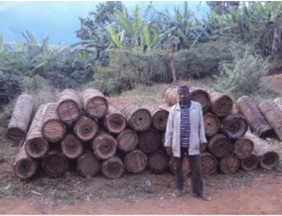
Bee farming lessons