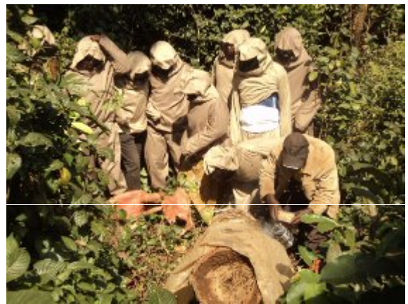
Beehives to distribute to trained groups