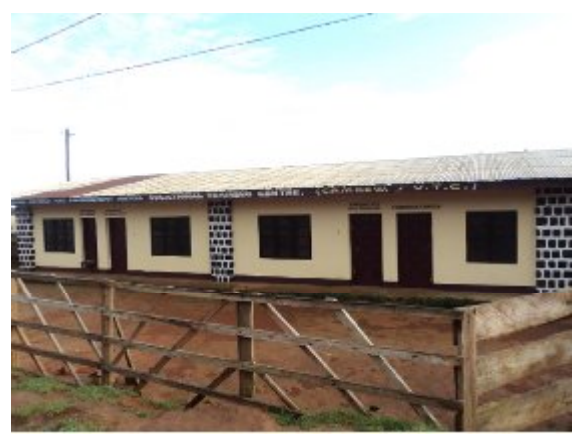
CAMGEW-Vocational Training Centre (VTC) Presentation

The 18th May 2013 was the CAMGEW-VTC Open-Door-Day. This day had as objective to make known the services rendered by CAMGEW-Vocational Training Centre (VTC) to the public especially youths. CAMGEW-VTC created awareness on the training opportunities offered to the public and services rendered. The young, the old; and the traditional and administrative authorities participated in the event. Three local musicians animated during the event. The musicians were youths. CAMGEW discovered many talents in youths who interpreted music while dancing. The administrative authority cut the ribbon inaugurating the CAMGEW-VTC while there was continues display by the musicians, the VTC trainers continued working in their various workshops and members of the public visited them and asked questions. The Oku Community Radio was present and did coverage and this event has been rebroadcasted many times over the radio for sensitization. The students of the VTC who were all uniformly dressed amazed everyone when they came up with a welcome song and made some speeches. All of us were happy because they believed much in the training that CAMGEW-VTC offered and the VTC itself. CAMGEW received many promises from the public. CAMGEW-VTC appealed for support from those who attended the event, to help students with no means to support the running of the VTC. Funds raised during this event helped pay fees for 4 students partially.